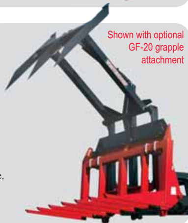
Shown with optional GF-20 grapple attachment

This fork bucket has seven heat treated forged steel tines. They are extremely strong and cut with a 45° taper to prevent the ends from becoming snagged on floor board or cracks. An excellent tool for cleaning out barns or handling silage.