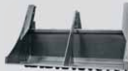
Teeth on top and bottom overlap and close tightly to handle loose materials. When open, it acts as a dozer blade to pack silage or move snow.