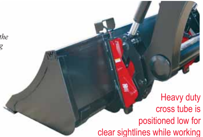
Heavy duty cross tube is positioned low for clear sightlines while working

See and feel the difference with a loader that fits properly with the bucket close. Clear visibility in all directions while maintaining balance, sharp turning radius, and more power.