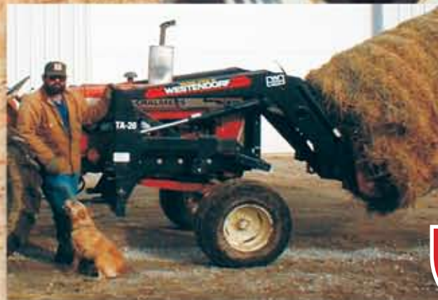
Steve Craig with Taco - Ashland, MO

Our expansive Traction Action (TA) product line includes a wide variety from Mid-Sized loaders to Super-Sized loaders designed to fit 2WD and 4WD tractors ranging from 10 HP to 240 HP. Nobody knows loaders like Westendorf. No matter what the need or which tractor you are trying to fit, Westendorf can fit you into a loader that's a cut above the rest. Just look at some of the key features that create the Westendorf advantage. Hydraulic Power-Mount™. Patented Snap-Attach™ Quick Change System. Custom adjust brackets. I-Beam construction. Level-Matic™. Low-Profile design for 4WD tractors. Hydra-Snap™ one-step coupling. Comfort Ride.